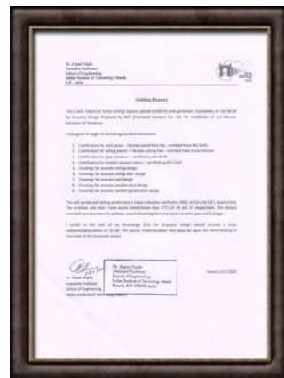
IIT Vetting Report